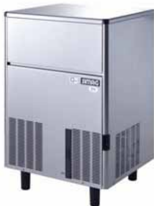
Self Contained Solid Ice Cube IM0065SSC