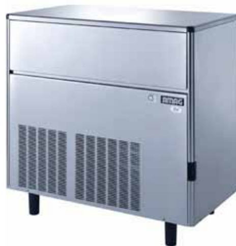
Self Contained Solid Ice Cube IM0113SSC